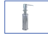
Soap Dispenser Model No. 560