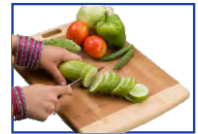
Chopping Board Model No. 558