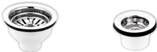
3" Coupling Model No. 553