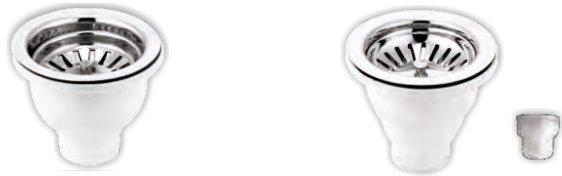
4" Coupling Model No. 551