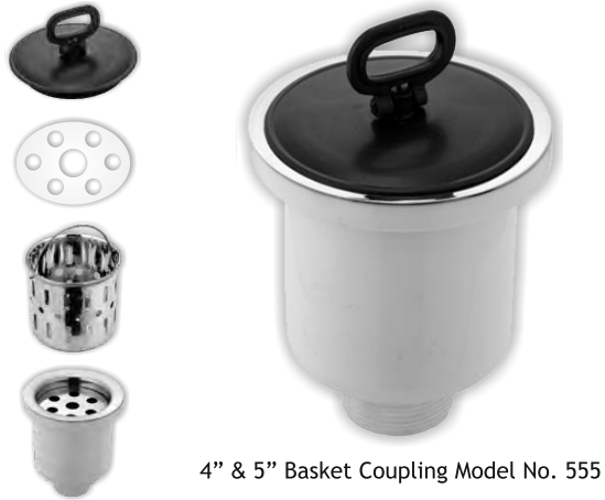
4" & 5" Basket Coupling Model No. 555