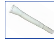
Flexible Waste Pipe Model No. 557