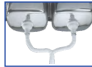
Double Bowl Connector Model No. 556