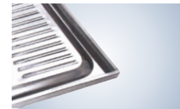
# SIT ON (TRIPLE BENDING)